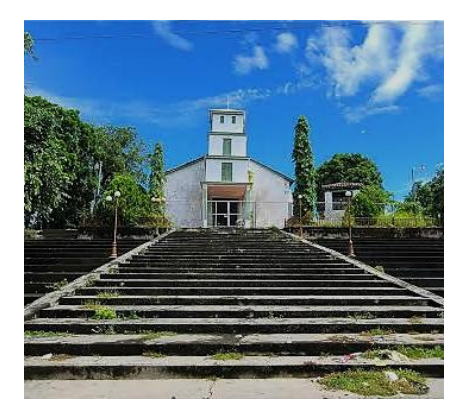
Figure 15: Virgen de la O Church.

The work dates from the 17th century. In the east access it has writing that it was built in 1670.