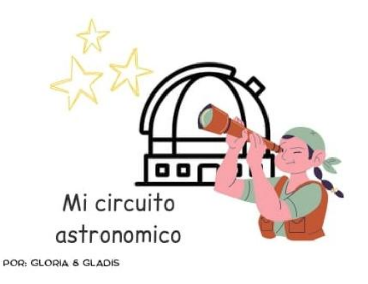
Figure 18: My astronomical circuit logo.