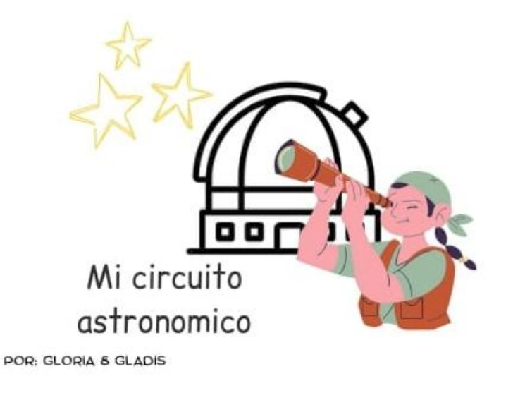
Figure 16: My astronomical circuit.