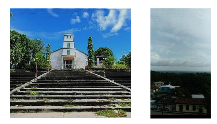
Ilustration 3: Virgen de la O Church.