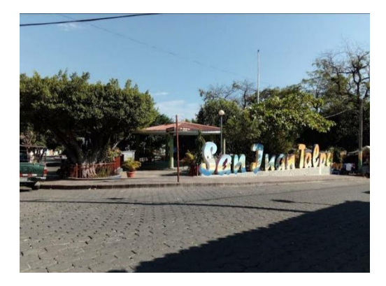
Ilustration 2: Municipal park of el salvador.