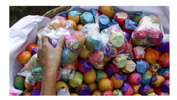
Figure 14: eggshells filled with confetti - tuesday of carnival.

It is a celebration where the inhabitants of the town gather carrying eggshells filled with confetti or other materials to burst them on the heads of their friends, this It usually takes place 40 days before Palm Sunday, so it is a moving date and varies every year.