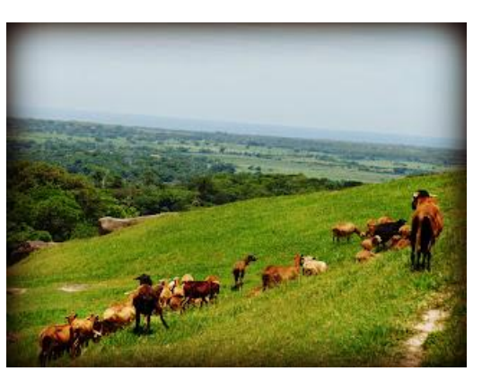
Figure 9 :Cueva del Pistolero. Recovered from: http://vergavilaelguanaco.blogspot.com/2012/07 /a-mi-gran-amigo.html