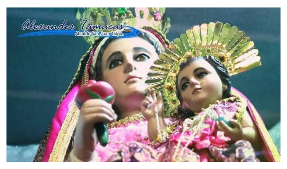
Figure 12: Virgin Maria de La O.

Are from December 9 to 18 in honor of the Virgin Maria de La O, patron saint of the Sailors.