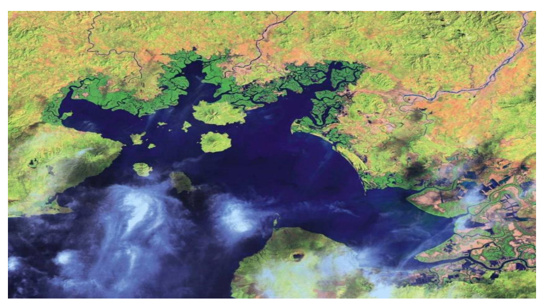
Satellite's view of the Gulf of Fonseca.

The waters of the Gulf of Fonseca average 30 °C, and with the temperature of the winds, it drops to 27.5 °C. It has sweet forests, important mangroves, and cliffs with endemic vegetation and represents the only place in the country with a rocky beach-sweet forest transition. It is also a complex of islands that are located on a rocky seabed on a cliffy coast with pocket beaches, which have an extraordinary richness of species, some of which are unique in the country. Dolphins, clams, oysters, octopus, mussels, and squeezing crabs, among others, are recorded.