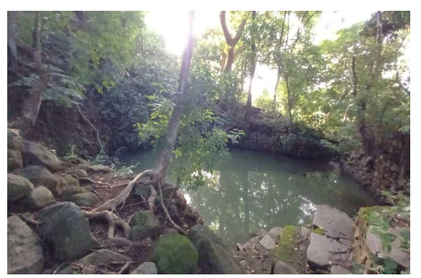
Source: La Pilona. The picture was gotten from the web "Conchagua, lo major de mi Tierra, on April 20, 2023.

One day, the chief of the Conchaguas gathered all the men to build a large basin in the mountain, called Chilagual, because the Goddess of the Waters had revealed to the chief in a dream that in that place a fountain would spring up that would serve to mitigate the thirst of the inhabitants of the village and their descendants.