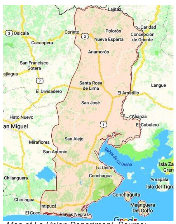
Map of La Union Department.

Natural resources play a very important role in the functioning of tourism in our country because it is in the environment in which most tourism is developed. The eastern part of El Salvador is characterized by its very diverse ecosystems that offer different types of tourism to tourists, but this document is focused on the La Union department, which has very important natural resources such as its beaches, rivers, lagoons, volcanoes, mountains, and fauna that make it unique in the country—resources with great tourist potential. (ILS LEDA, 2012)